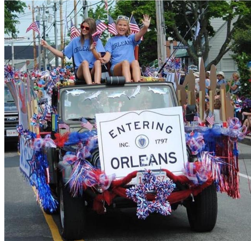
Orleans Fourth of July Parade

Miles of Town Maintained roads: 54 Miles