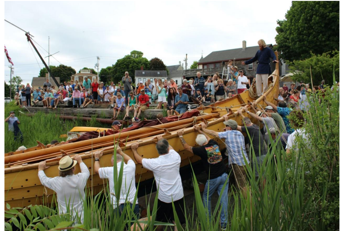
[Essex River Cultural District]

NEW: Grants to organizations (including schools) to fund festivals, projects, residencies, and other cultural activities in the arts, humanities, and sciences. This program combines Festivals & Projects and Creative Projects for Schools into one program. (Application opens March 2025)