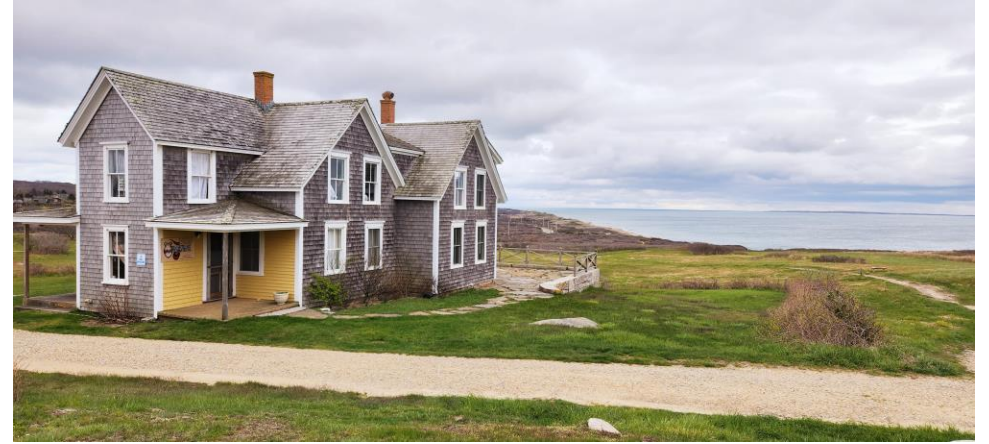
Aquinnah Cultural Center: Aquinnah Circle Cultural & Historic District

Two-year grants to Massachusetts nonprofit and municipal performing arts centers to spend on touring shows or touring artist fees. Grants have ranged from $6,000 to $200,000. (Deadline to apply is January 9, 2025)