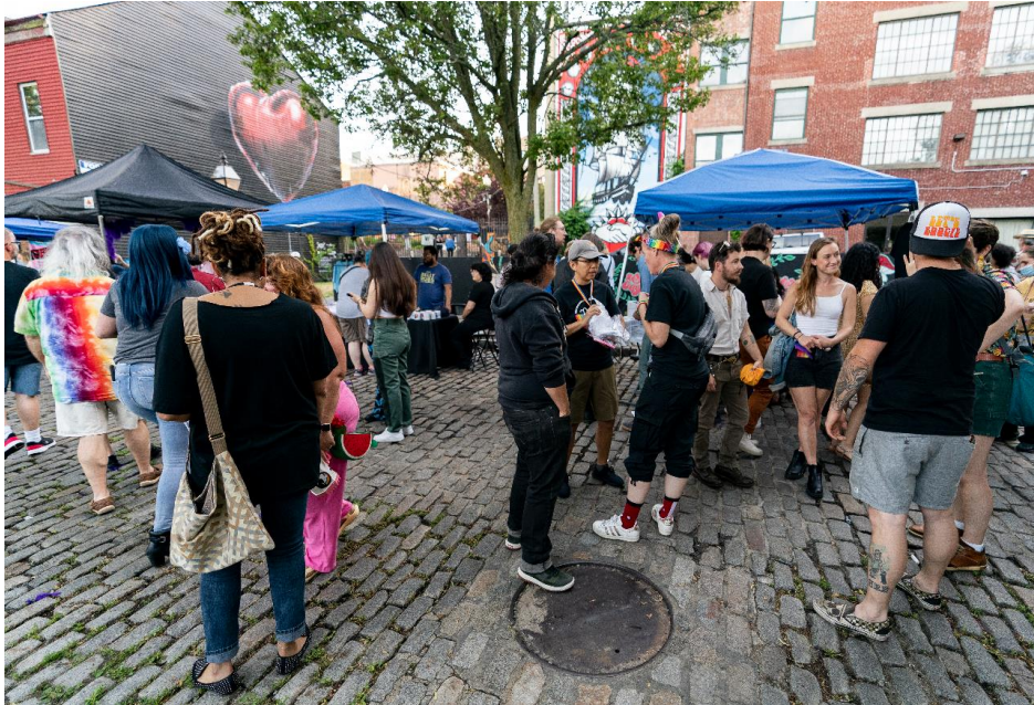
[New Bedford's Seaport Cultural District]

Arts and culture are essential for economic prosperity, innovation, creativity, and good health. The sector is key to a strong state economy.