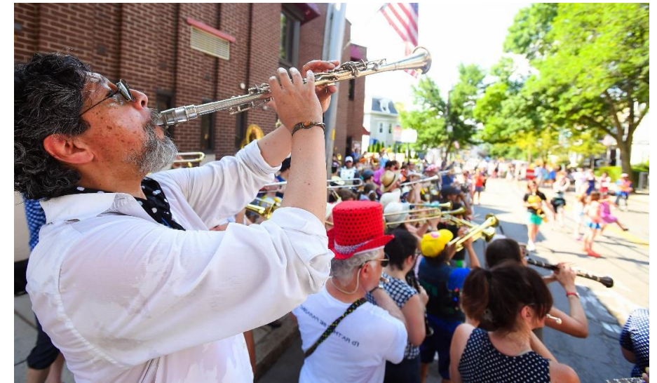
[Somerville Glass Artist Festival]

We welcome the opportunity to work together to build on this and discuss opportunities to create new revenue streams, recognizing that any local option tax requires legislative endorsement.