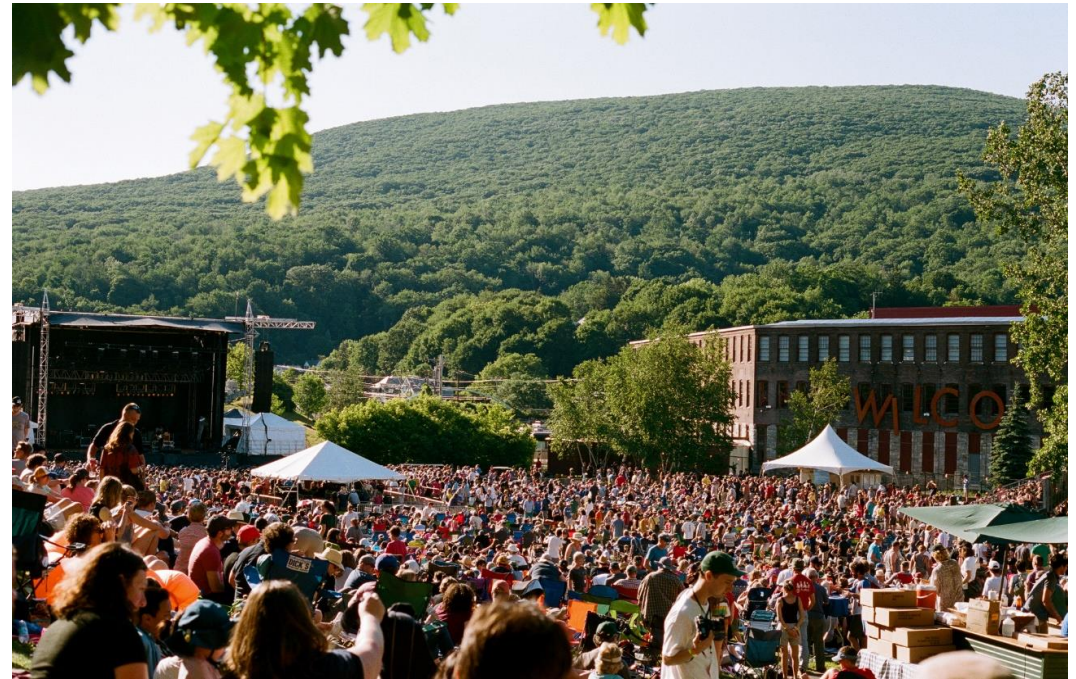
[MASS MoCA, Solid Sound Festival]