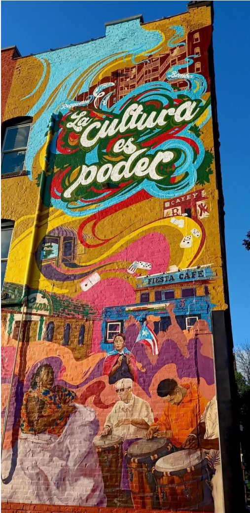
[ 'La Cultura es Poder': Holyoke Puerto Rican Cultural District ]