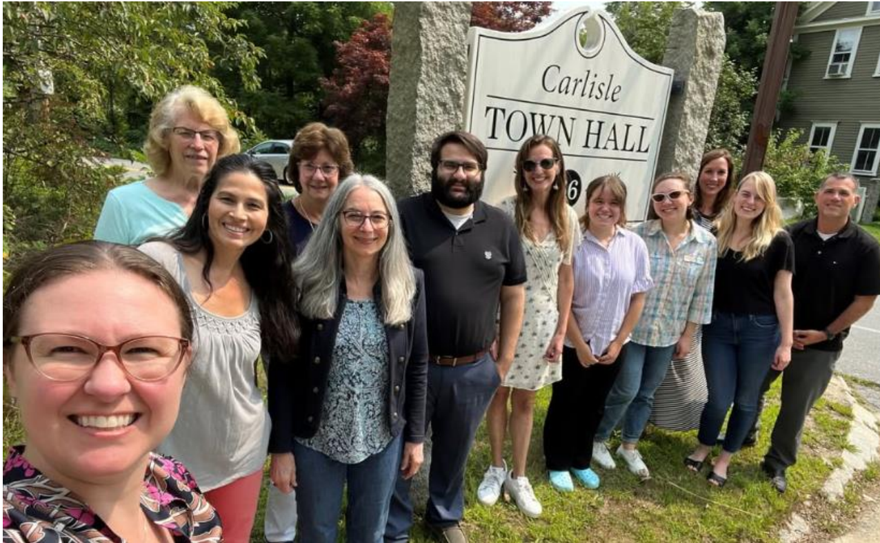
Town of Carlisle staff

The Town of Carlisle was incorporated as a District on April 19, 1754, and as a Town on February 18, 1805