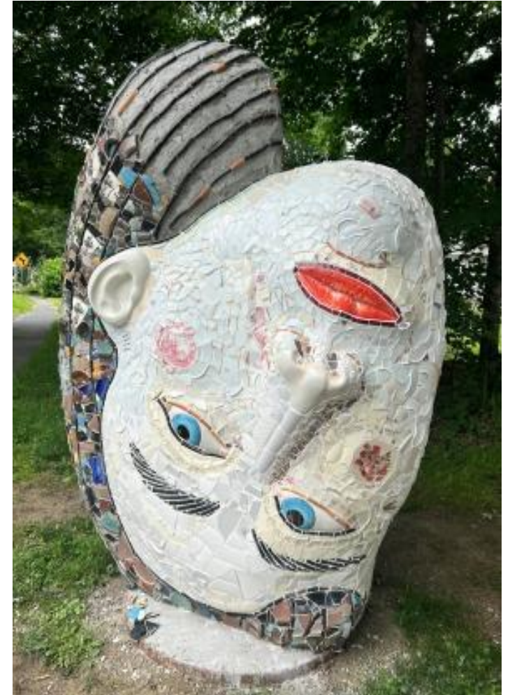
Cummington Cultural District