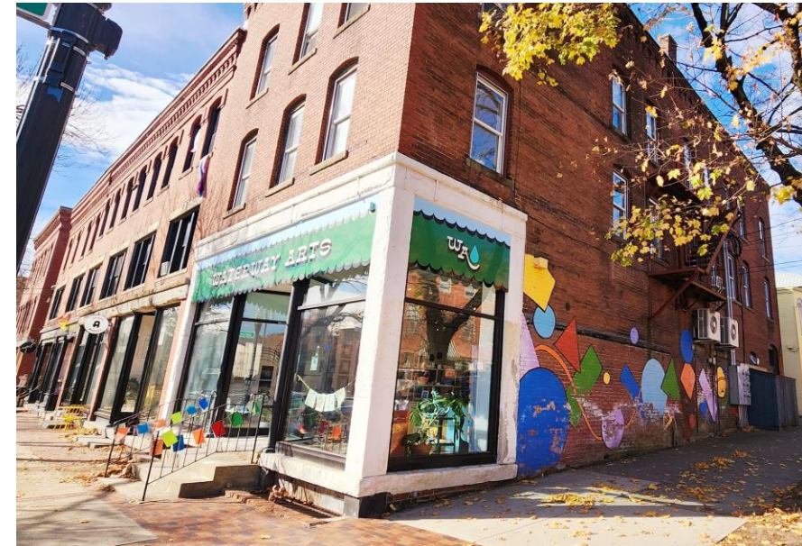
Turners Falls Cultural District

Read our recent blog for more economic impact info!