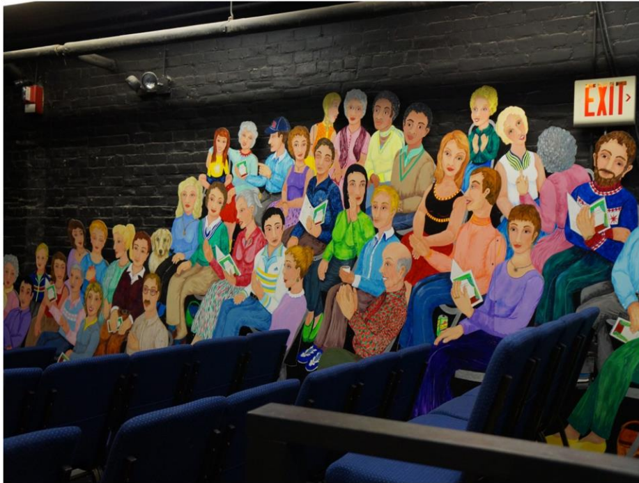
Assabet Village Cultural District | Maynard

A Cultural District Designation is good for 10 years .