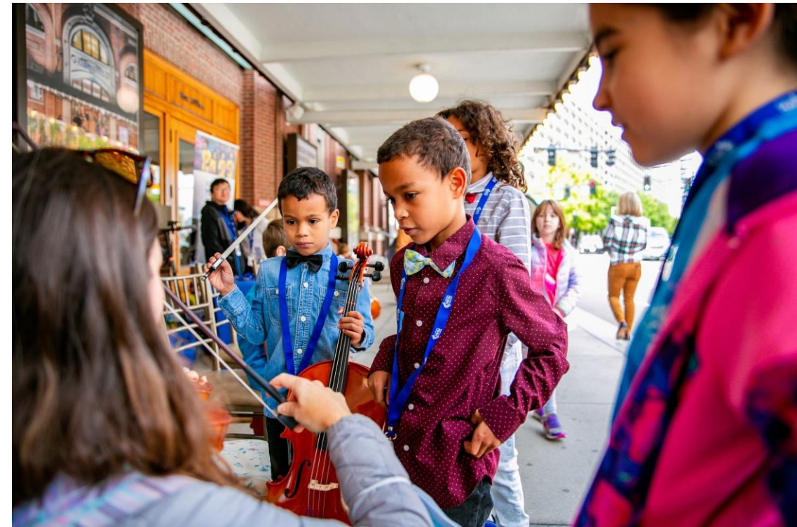
Fenway Cultural District's Opening Our Doors day.