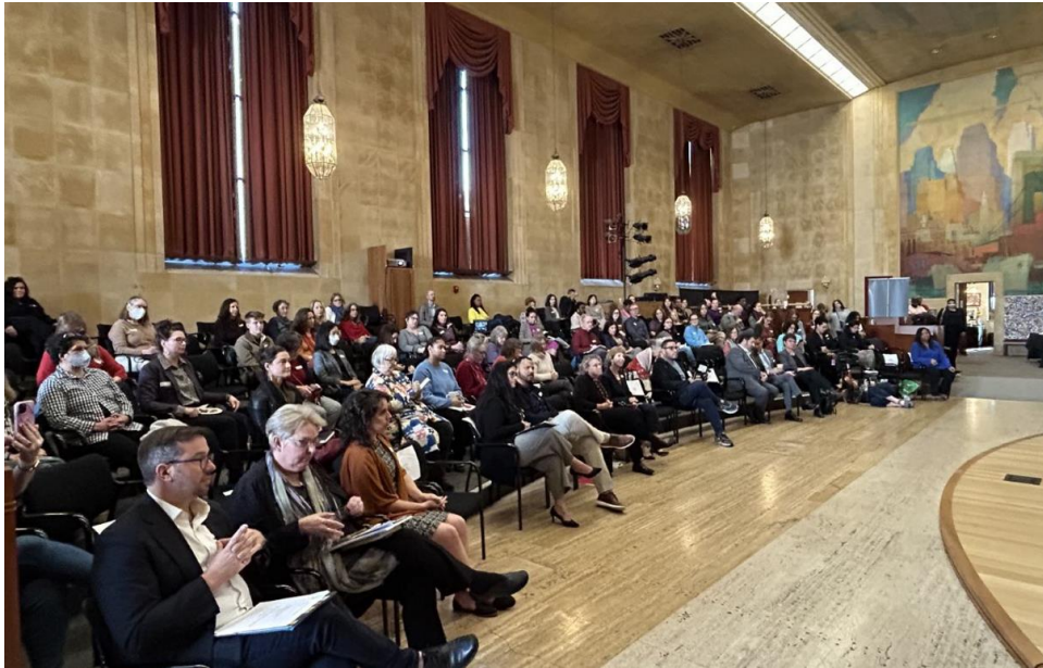
Health & Wellness through Creativity Panel Event | October 2023

We've built a strong foundation and taken action to establish and reignite relationships with key collaborators to embed the arts more prominently within key sectors across the Commonwealth: