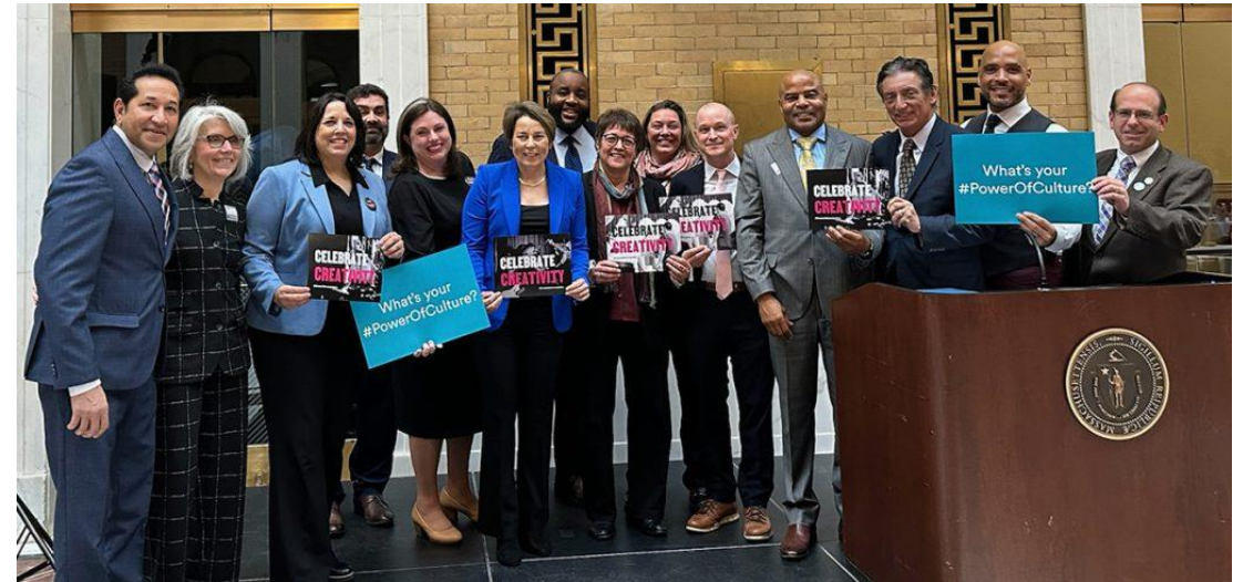
Creative Sector Advocacy Day 2024