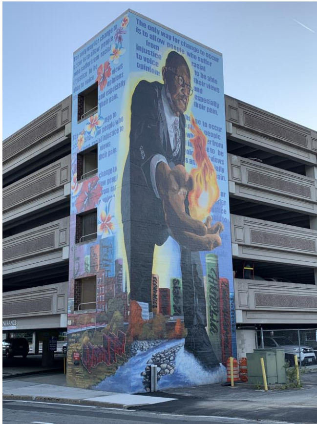
City of Fitchburg