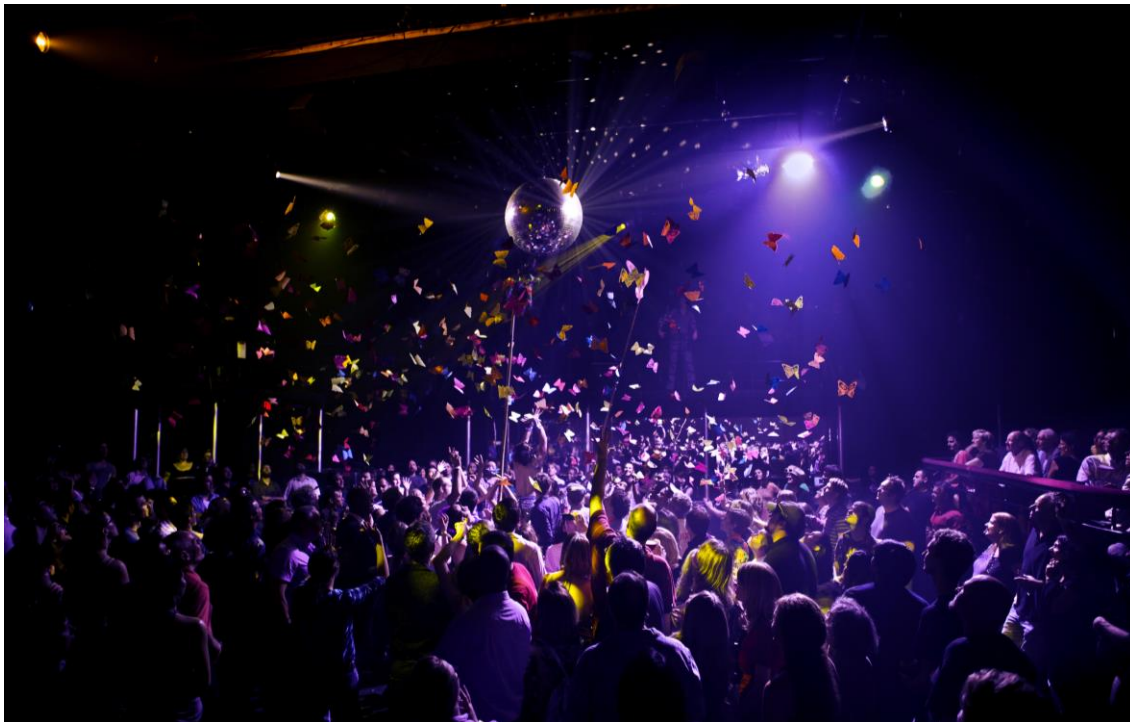
The Donkey Show at OBERON, American Repertory Theatre

Arts and cultural attractions help drive tourism. The AEP6 study, conducted by Americans for the Arts found: