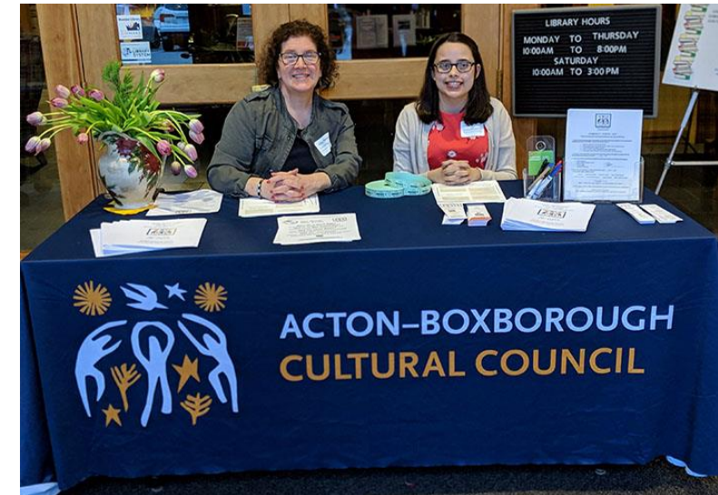
Acton-Boxborough Cultural Council