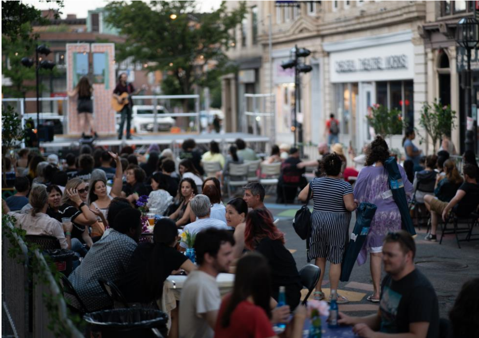
Apollinaire Theatre, Chelsea.

Arts and culture are essential for economic prosperity, innovation, creativity, and good health. The sector is key to a strong state economy.