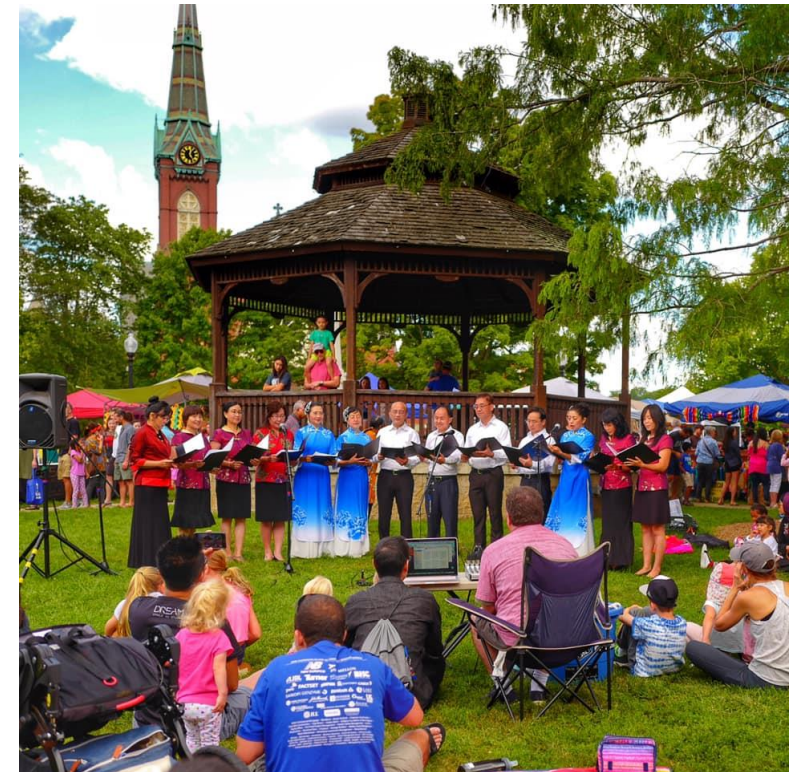
Multicultural Day | Natick Cultural District

Join us for our next webinar for even more inspiring examples and ideas of how to use the arts to improve your city town!