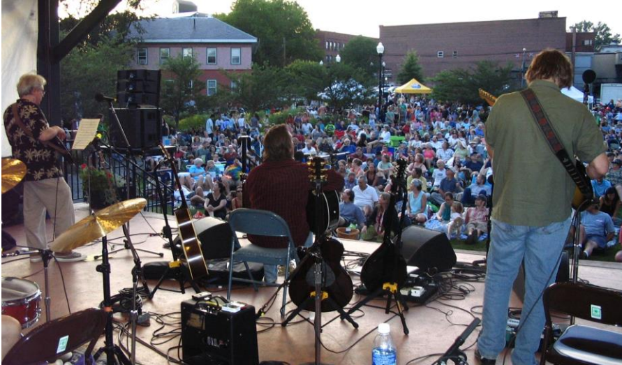
Crossroads Cultural District | Greenfield