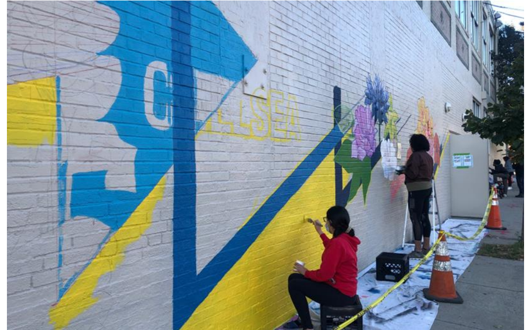
Green Roots, Chelsea

Program is being redesigned, but it will continue to fund creative learning opportunities at schools. (Application opens fall 2024)