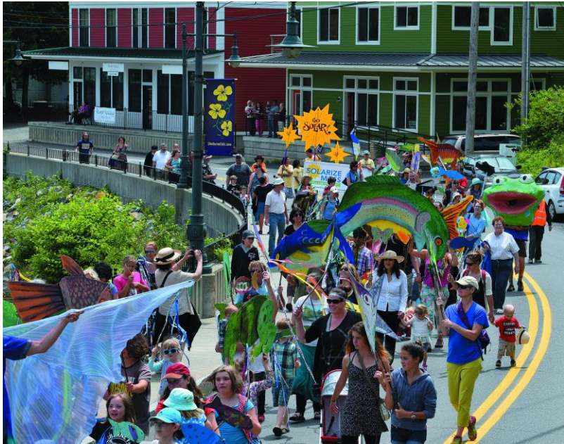
Shelburne Falls Cultural District

They are your direct line to the cultural community in your city/town